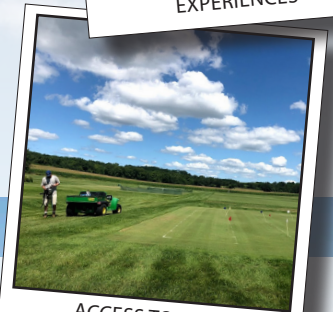
ACCESS TO TURF RESEARCH CENTER