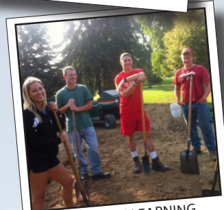
HANDS-ON LEARNING EXPERIENCES