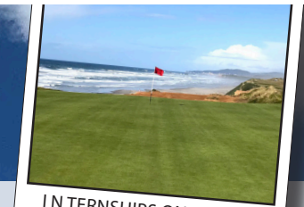
INTERNSHIPS ON WORLD CLASS GOLF COURSES!

This non-credit apprenticeship program combines classroom knowledge with on-the-job skills to prepare students for professional careers in the turfgrass management industry. Students come to UW-Madison's campus to take turfgrass management classes every Tuesday through Thursday during two 6-week sessions in the winter (Nov. – Feb.). After the coursework ends, students work with an employer (golf course, athletic facility, etc) to complete the apprenticeship program by mastering skills in the field necessary for a leadership position in turfgrass management. This program is ideal for those currently working in the turfgrass industry who are looking to advance their career.